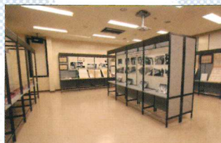
© Inside of the display room

The historical documents of a local politician and a business leader who contributed to the development of the Amakusa region are on display.